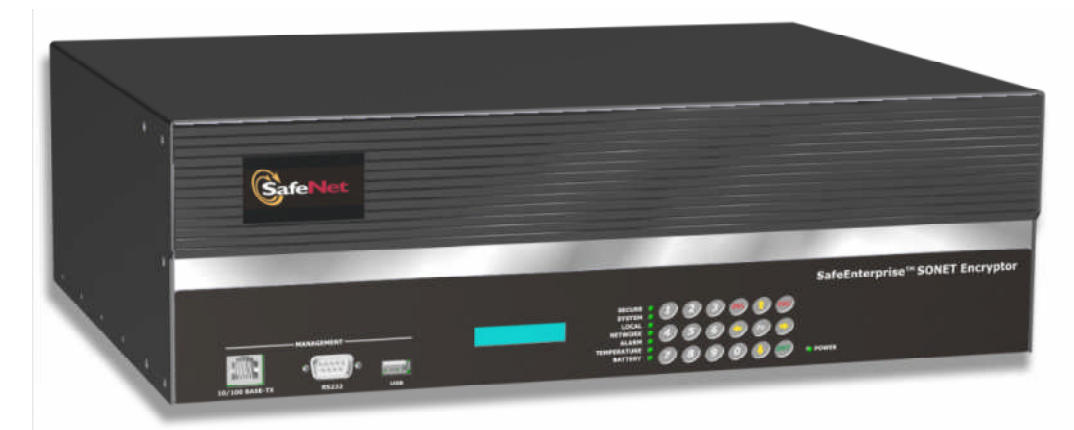
Figure 4. Model 650 Encryptor Front View.

The Model 650 encryptor has two network interfaces located in the back of the module: the Local Port interface connects to a physically secure private network and the Network Port interface connects to an unsecure public network. The rear panel also contains a tamper evident seal that indicates movement of the module cover with respect to the module enclosure.