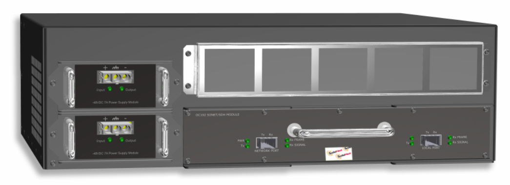
Figure 5. Model 650 Encryptor Rear View

The module has eight physical ports and four logical interfaces. The physical ports have the following functions: