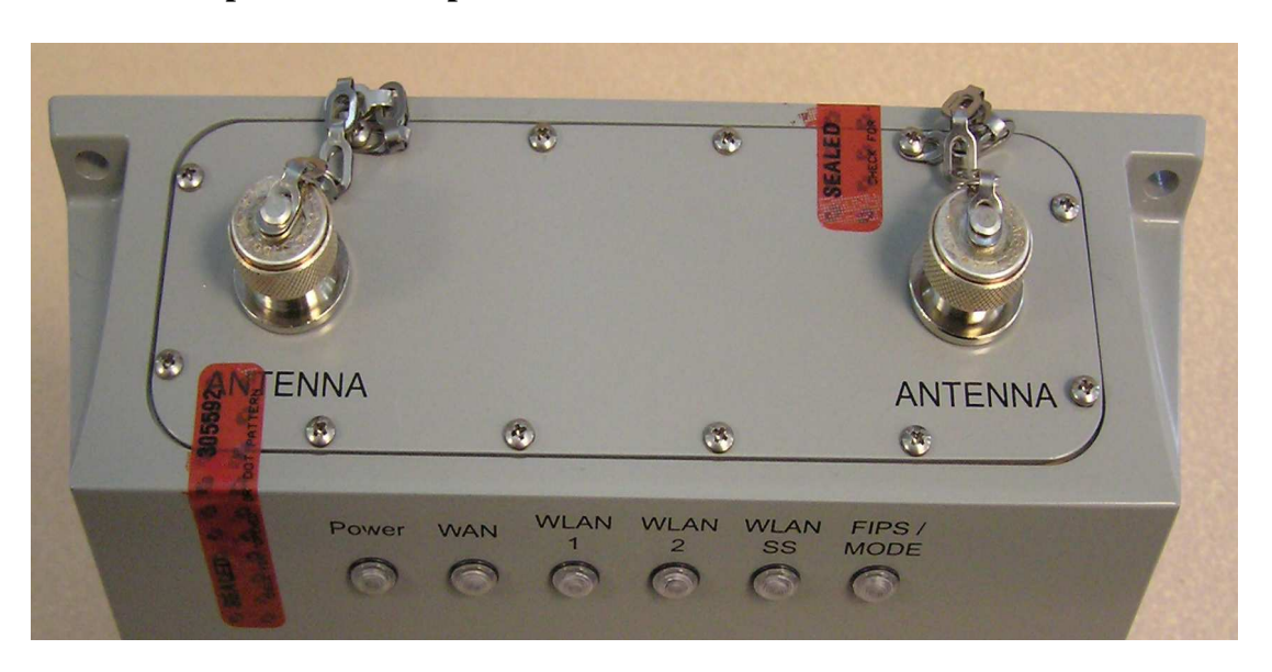
Figure 1. 3e-527A3 Standard – Antenna Panel