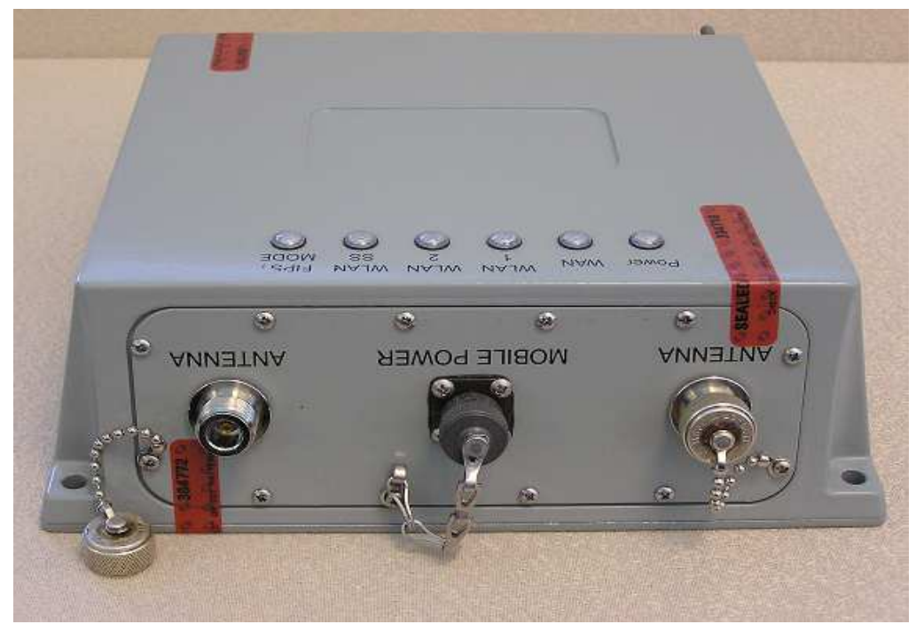
Figure 3. 3e-527A3MP Antenna Panel