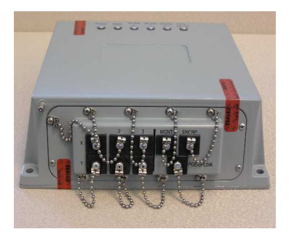
Figure 4. 3e-527A3MP– I/O Panel