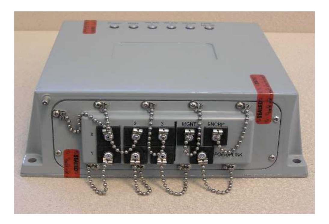
Figure 2. 3e-527A3 Standard – I/O Panel