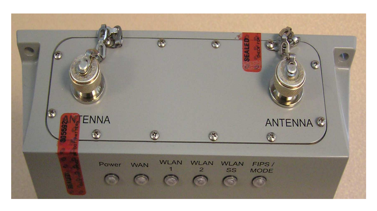
Figure 5. 3e-527A3 W/OUTDOOR OPTION – Antenna Panel