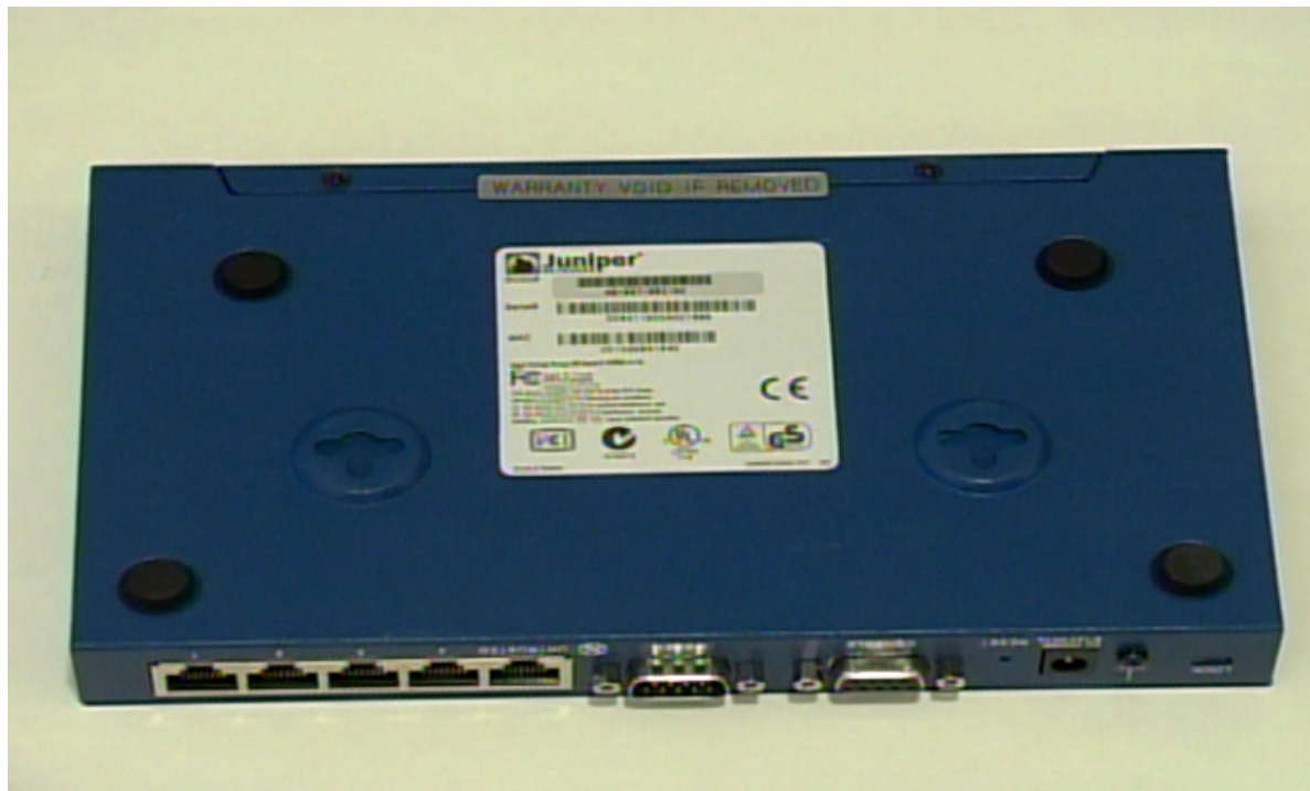
Figure 2: Underside of the NS-5GT device