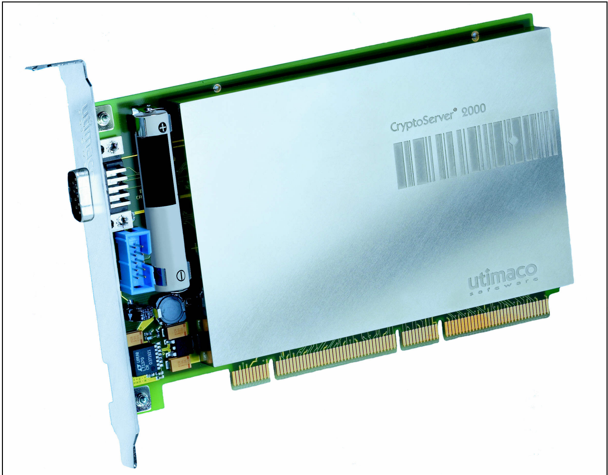
Figure 2 – CryptoServer 2000 mounted on the PCI carrier card