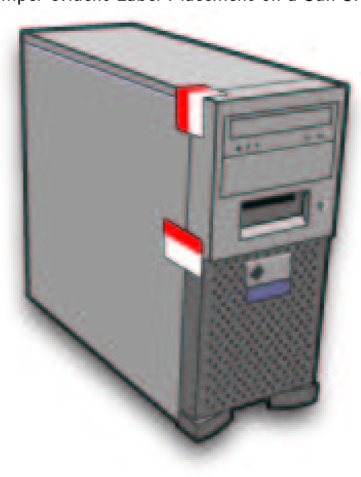
Figure 3.1: Tamper-evident Label Placement on a Sun SPARC Ultra-10.