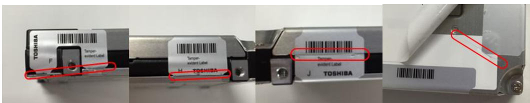
Cutting line (Security seals and OUTER SHEET)