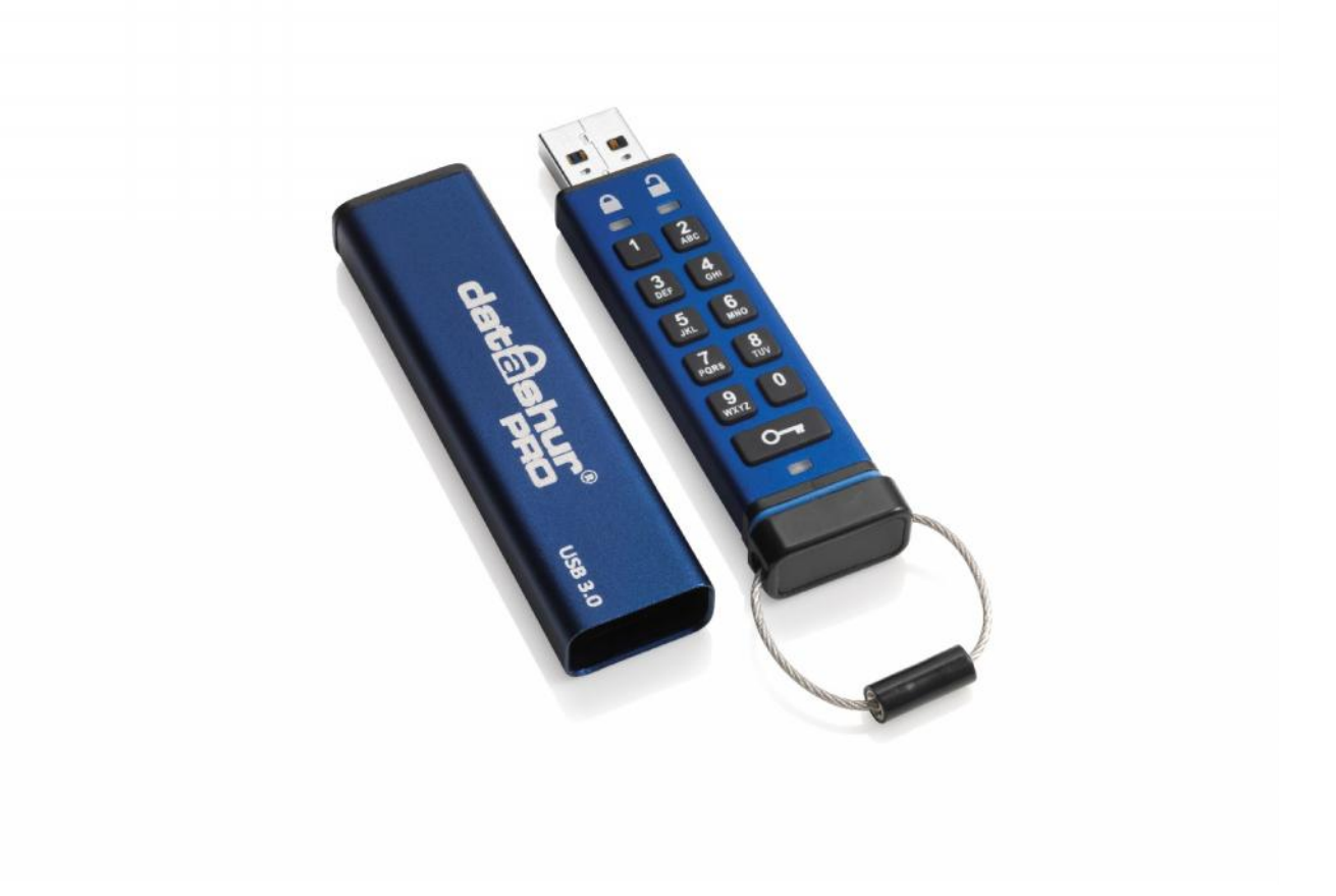
Figure 1: iStorage datAshur Pro cryptographic boundary showing input buttons and status LEDs