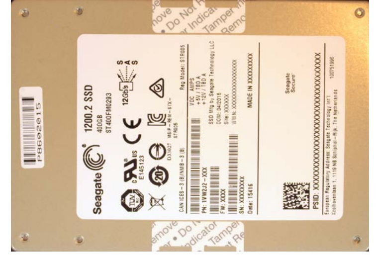
Figure 1: Top view of tamper-evidence label on sides of drive