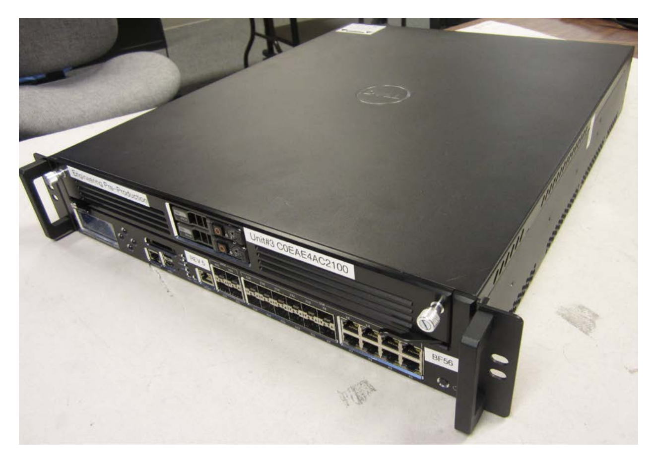
Figure 3 – SM 9800 Front

The chassis of the module is sealed with six (6) tamper-evident seals, which are applied during manufacturing. The physical security of the module is intact if there is no evidence of tampering with the seals. The locations of the tamper-evident seals are indicated in red numbers in Figures 3 through 5 below. The Cryptographic Officer shall inspect the tamper seals for signs of tamper evidence once every six months. If evidence of tamper is found, the Cryptographic Officer is requested to follow their internal IT policies which may include either replacing the unit or resetting the unit to factory defaults. For further instructions on resetting to factory defaults, please review SonicWALL guidance documentation.