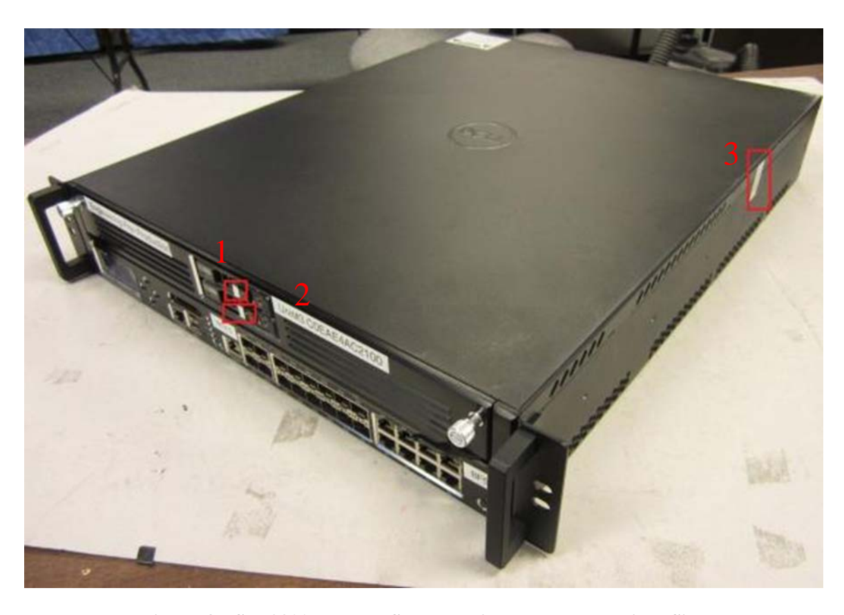
Figure 4-SM\ 9800\ Tamper\ Seal\ Location\ on\ Top\ and\ Right\ Side