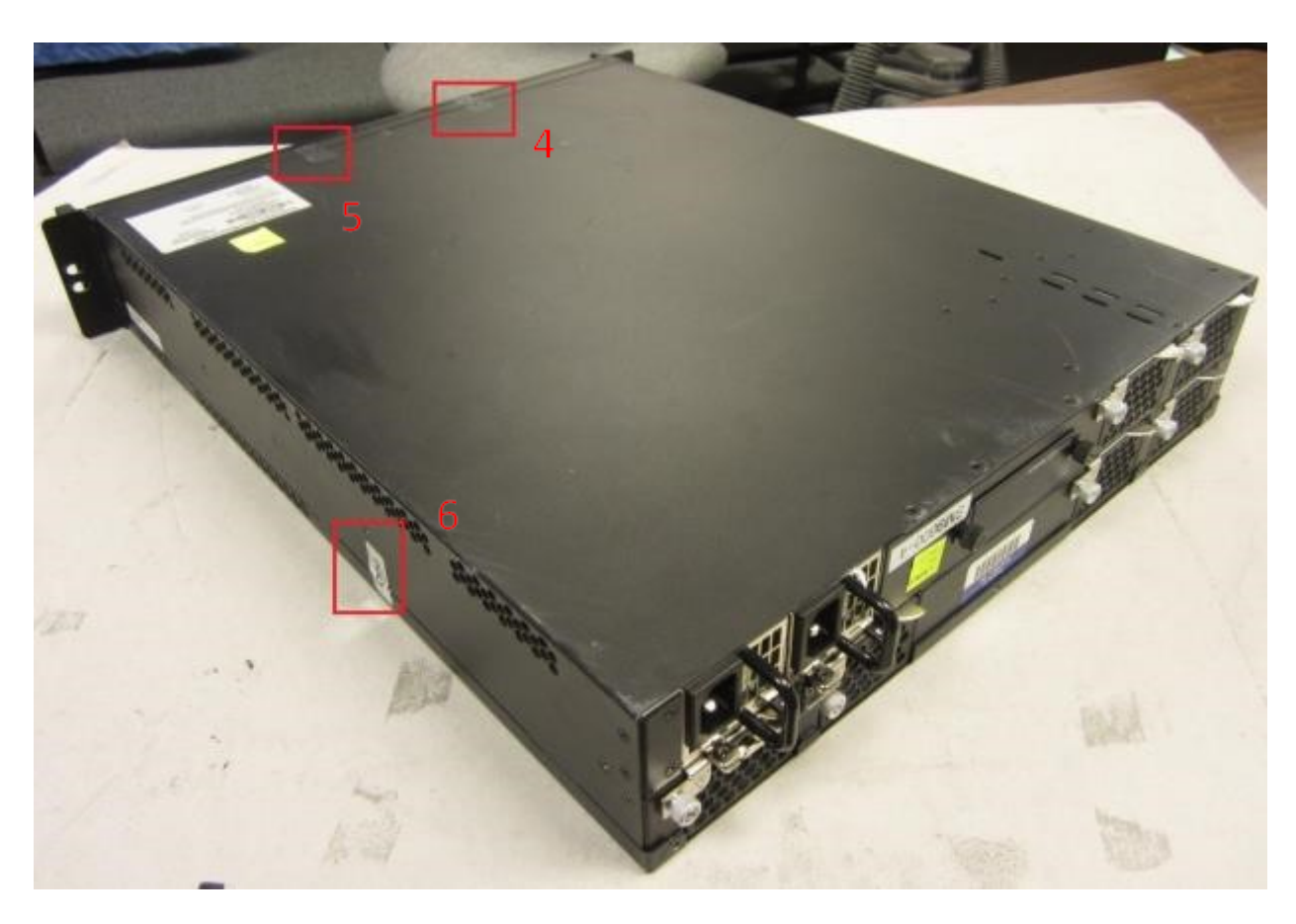
Figure 5 – SM 9800 with Tamper Seal Location on Bottom and Left Side