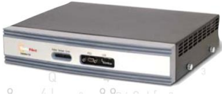
Figure 2-1. Luna G5 Cryptographic Module (with front bezel attached)