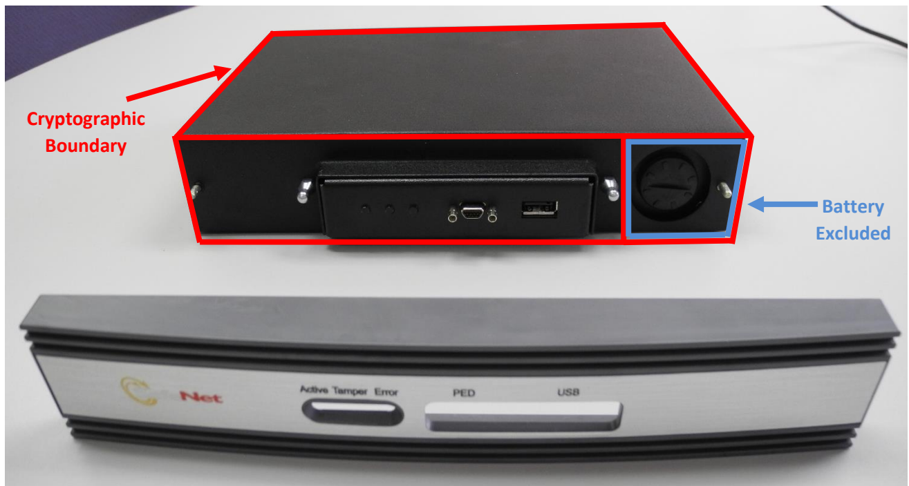
Figure 2-2. Luna G5 Cryptographic Boundary (with front bezel removed)