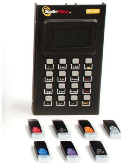
Figure 3-1. Luna PED and iKeys

Any iKey, once data has been written to it, is an Identification and Authentication device and must be safeguarded accordingly by the administrative or operations staff responsible for the operation of the module within the customer's environment.