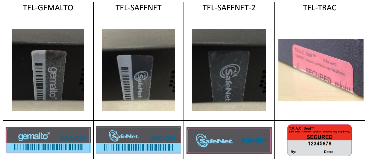
Table 3-9. TEL-GEMALTO, TEL-SAFENET, TEL-SAFENET-2 and TEL-TRAC Tamper Evident Labels

Four variants of tamper evident labels have been evaluated for use with this module: TEL-GEMALTO, TEL-SAFENET, TEL-SAFENET-2 and TEL-TRAC. Any of these tamper evident labels can be used in the FIPS-validated configuration of the module. Refer to the photographs in Table 3-9 to identify the different tamper evident label variants.