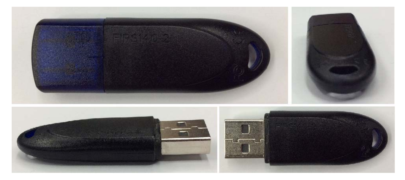
Figure 1. WatchKey ProX USB Token-4 angles

The physical boundary of the WatchKey ProX USB Token cryptographic module is defined as the opaque enclosure surrounding the token device as shown in the picture below.