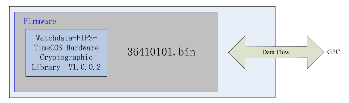
Figure 3. WatchKey ProX USB Token Logic Cryptographic Component Block Diagram

Note: 100 K of 257K Flash is used for file system, and 157 K left is used for code storage.