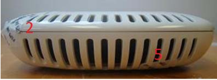
Figure 8: AP-135 Back view