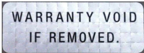
Figure 2 – Image of Tamper Evidence Seal

The enclosure is sufficiently hard, providing tamper detection and response in accordance with FIPS 140-2 level 3 physical security requirements. Hardness testing was performed at ambient temperature.