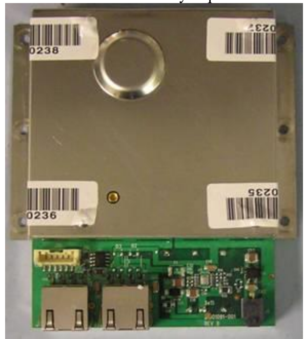
Figure 1 – 3e-945 AirGuard iMesh Wireless Gateway Cryptographic Module

This document describes the non-proprietary cryptographic module security policy for 3e Technologies International's ISA 100.11a wireless gateway product, the 3e-945 AirGuard iMesh Wireless Gateway Cryptographic Module (Hardware Versions: HW V1.0, Firmware Versions: 1.0). This policy was created to satisfy the requirements of FIPS 140-2 Level 2. It defines 3eTI's security policy and explains how the 3e-945 AireGuard iMesh Wireless Gateway Cryptographic Module meets the FIPS 140-2 security requirements.