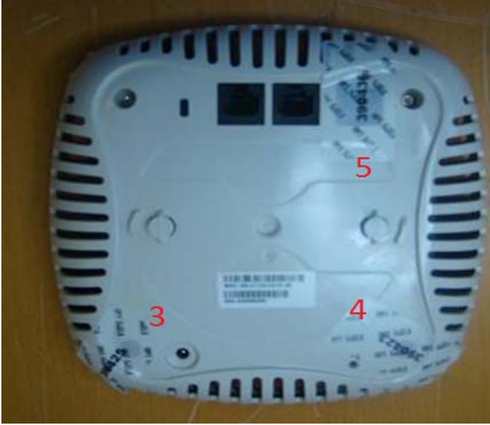
Figure 12: AP-135 Bottom View