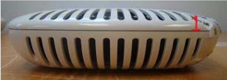
Figure 9: AP-135 Left view