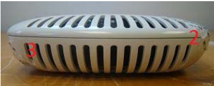
Figure 10: AP-135 Right view