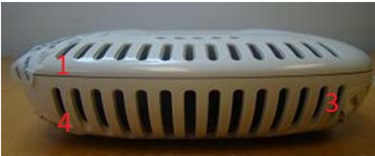
Figure 7: AP-135 Front view

Following is the TEL placement for the AP-135: