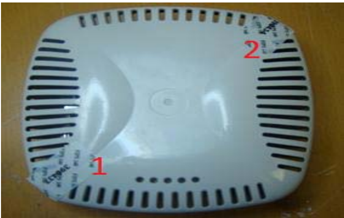
Figure 11: AP-135 Top view