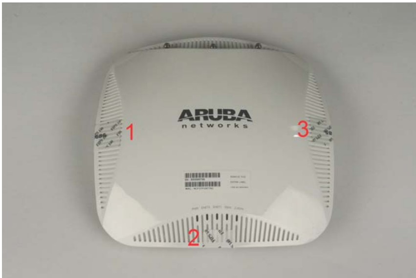
Figure 1: AP-224/225 Front/Top view

Following is the TEL placement for the AP-224/225: