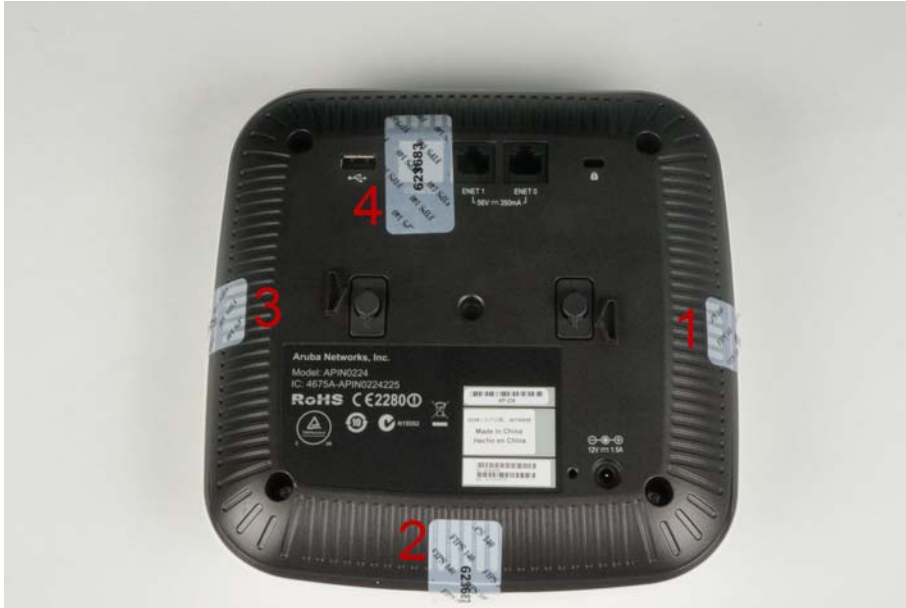
Figure 2: AP-224/225 Back/Bottom View