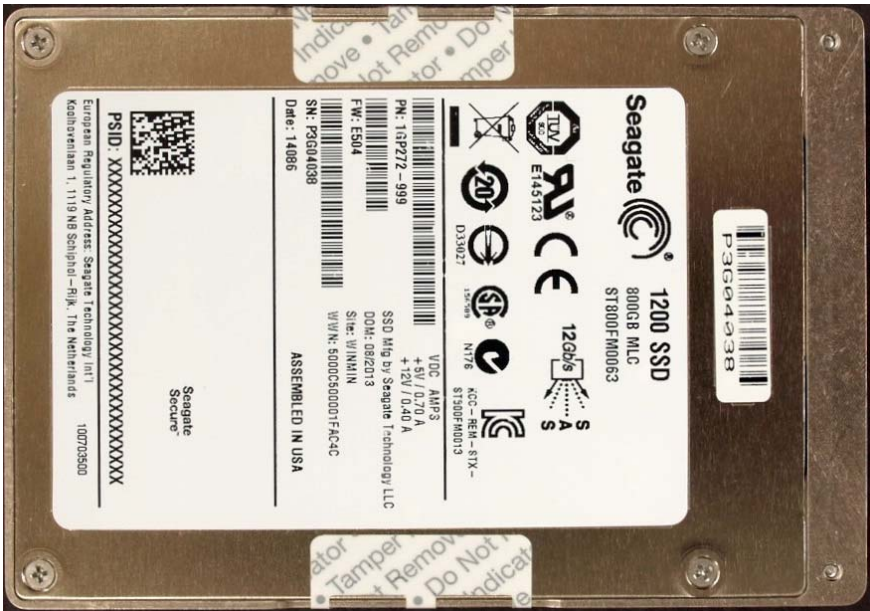
Figure 1: Top view of tamper-evidence label on sides of drive