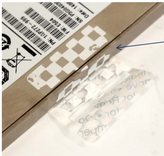
Tamper Evidence Checkerbox Pattern