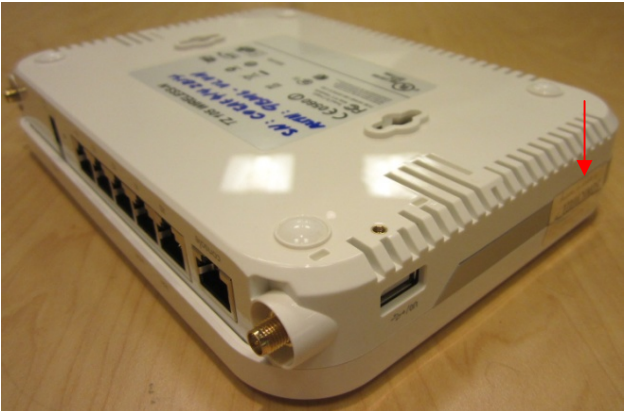
Figure 4 – TZ 105W Tamper Evident Seal