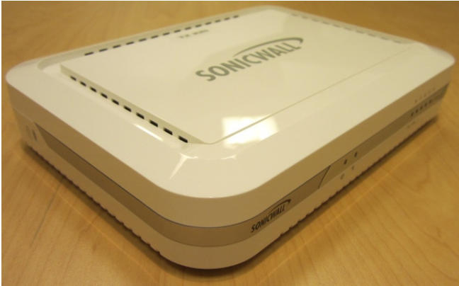
Figure 1 – TZ 105

The Cryptographic Officer must physically inspect the module for signs of tamper every six months. If the module shows any evidence of tamper, the Cryptographic Officer should contact Dell SonicWALL.