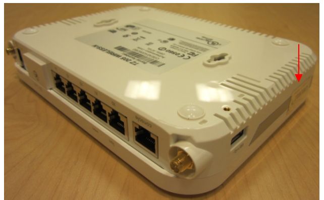
Figure 8 – TZ 205W Tamper Evident Seal

Note: The tamper-evident seal is in the same location on the TZ 210, TZ 210W, TZ 215, and TZ 215W.