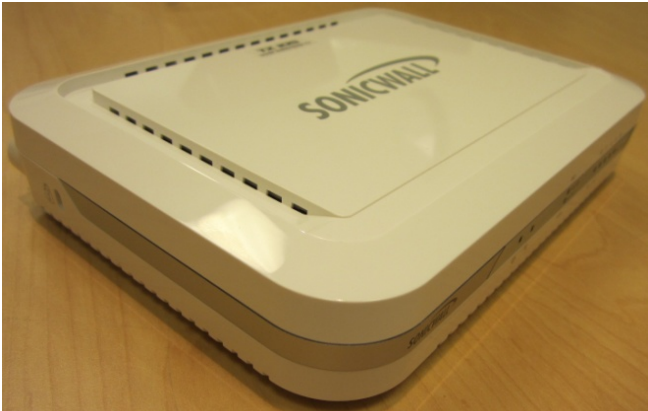
Figure 3 – TZ 105W