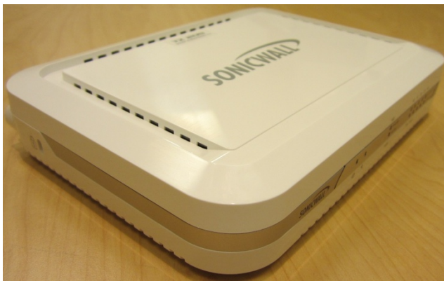
Figure 7 – TZ 205W