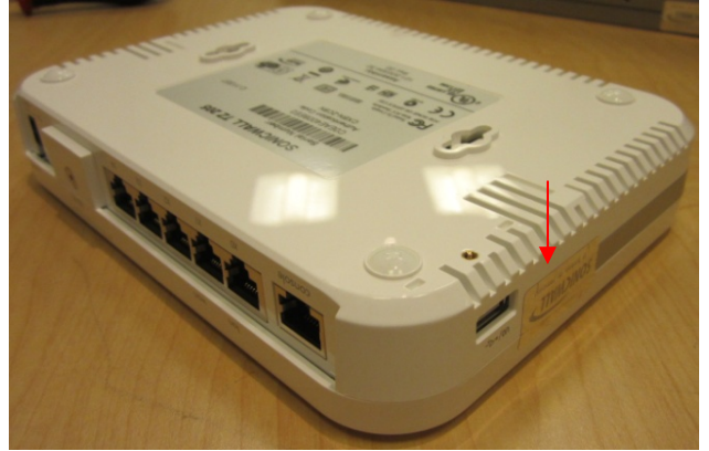
Figure 6 – TZ 205 Tamper Evident Seal