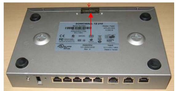
Figure 10 – TZ 210 Tamper Evident Seal