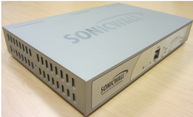
Figure 15 – TZ 215W