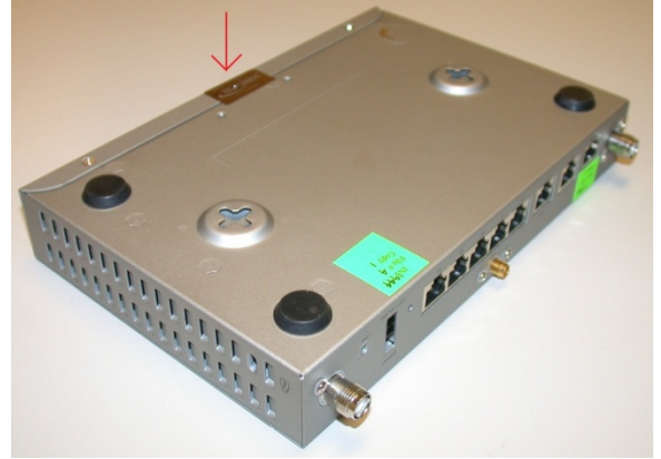
Figure 12 – TZ 210W Tamper Evident Seal