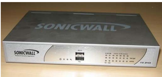
Figure 9 – TZ 210

Note: The tamper-evident seal is in the same location on the TZ 210, TZ 210W, TZ 215, and TZ 215W.