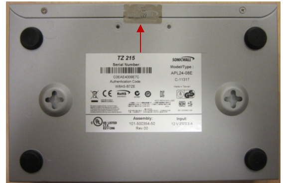
Figure 16 – TZ 215W Tamper Evident Seal