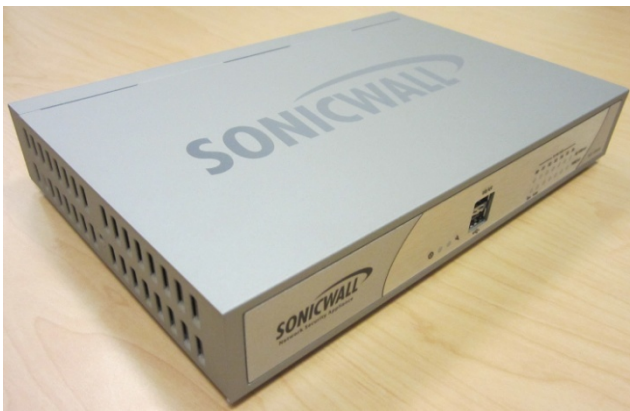
Figure 13 – TZ 215