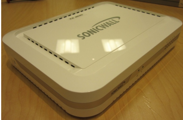
Figure 5 – TZ 205