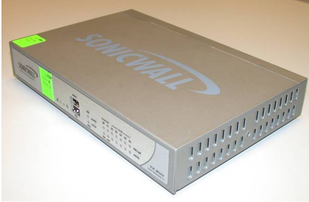
Figure 11 – TZ 210W