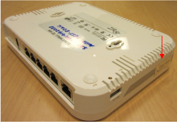
Figure 2 - TZ 105 Tamper Evident Seal