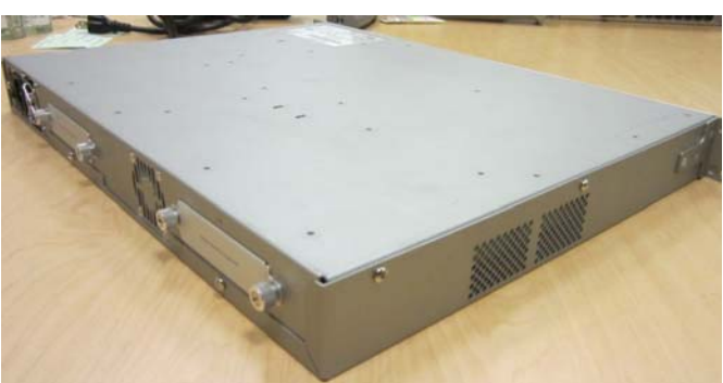
Figure 6 - NSA 2400MX Underside/Rear/Right

The tamper evident seal is applied by Dell SonicWALL during the manufacturing process. The Cryptographic Officer should inspect the module to ensure that the tamper evident seal has been applied on the bottom of the module, as shown above. The Cryptographic Officer must physically inspect the module for signs of tamper every six months. If the module shows any evidence of tamper, the Cryptographic Officer should contact Dell SonicWALL.