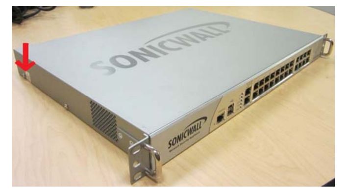
Figure 5 - NSA 2400MX Top/Front/Left