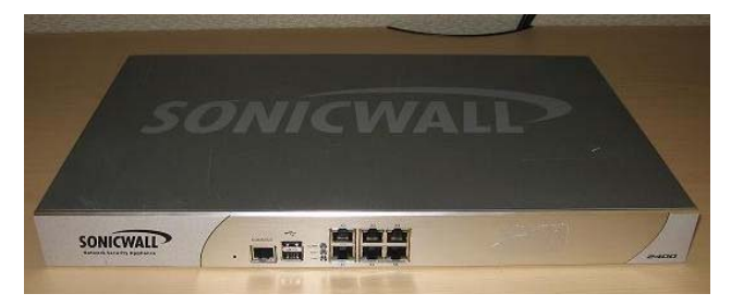
Figure 4 – NSA 2400 Top/Front