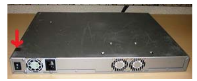
Figure 3 – NSA 2400 Underside/Rear

The chassis is sealed with one tamper-evident seal, which is applied during manufacturing. The physical security of the module is intact if there is no evidence of tampering with the seal. The location of the tamper-evident seal is indicated by the red arrows in Figures 1 and 3 below: