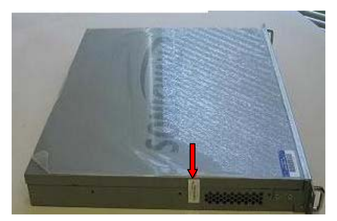
Figure 3: Tamper Evident Seal

The chassis is sealed with three tamper-evident seals, which are applied during manufacturing. The physical security of the module is intact if there is no evidence of tampering with the seals. The locations of the tamper-evident seals are indicated by the red arrows in Figures 1 and 2 below: