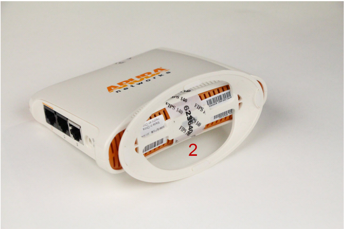
Figure 2 - RAP-3WN/RAP-3WNP Bottom View