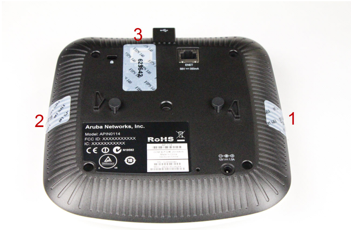
Figure 6 - AP-114/115 Bottom View