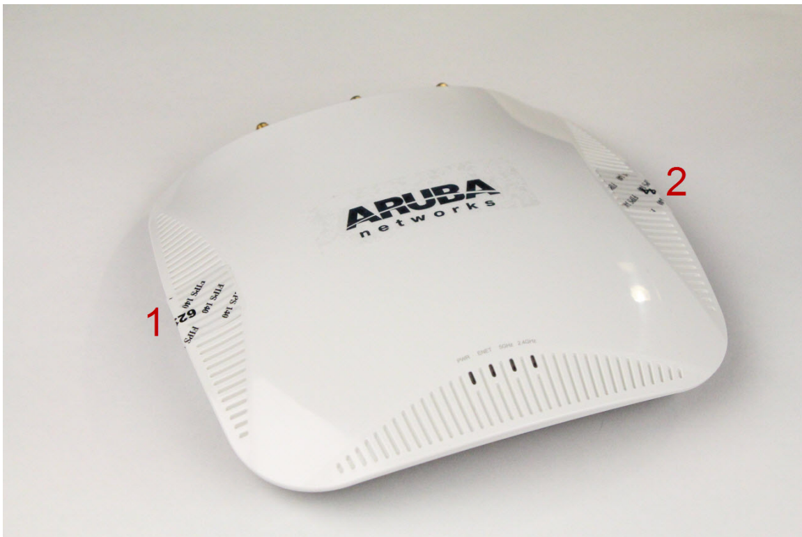
Figure 5 - AP-114/115 Top View

Following is the TEL placement for the AP-114 and AP-115: