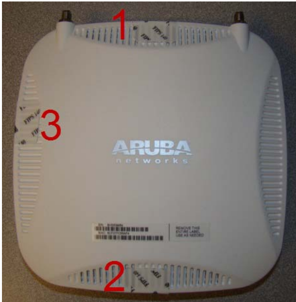
Figure 3 - RAP-108/109 TEL Placement – Top View

Following is the TEL placement for the RAP-108 and RAP-109: