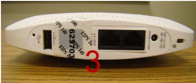
Figure 4 - RAP-108/109 TEL Placement - Side View