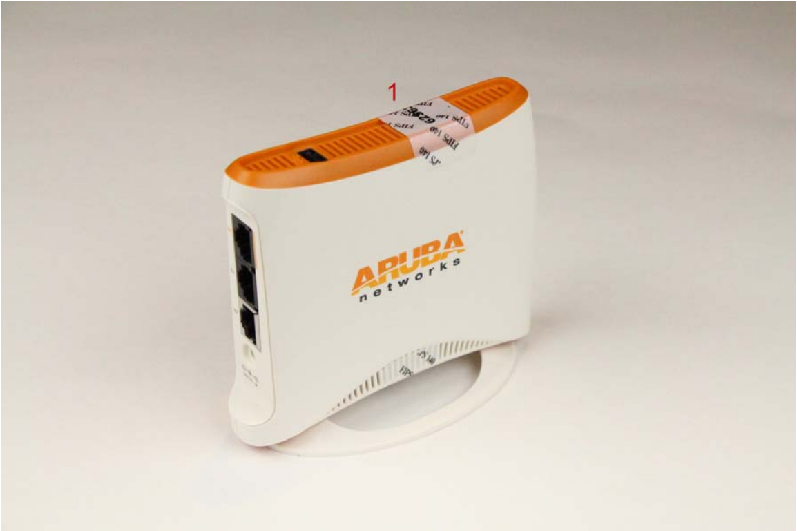
Figure 1 - RAP-3WN/RAP-3WNP Top View