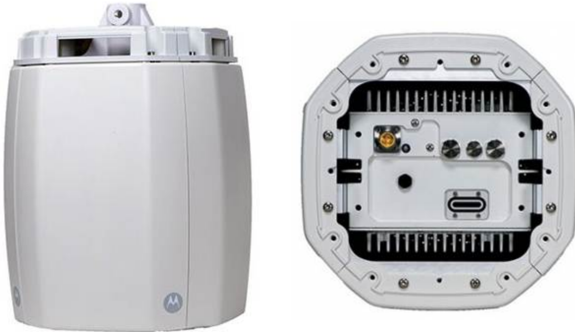
Figure 4 – AP 7181 views

Figure 4 depicts the AP7181. Table 5 describes the AP7181 ports and interfaces.