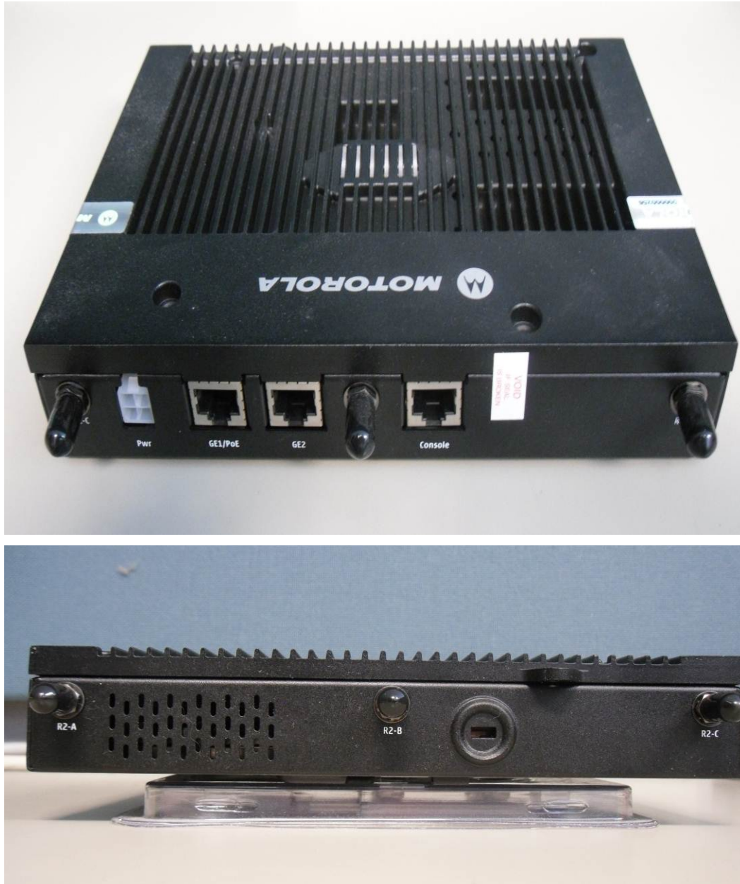
Figure 2 – AP 7131 with plastic shroud and antennas removed

Figure 2 depicts the AP 7131N-GR – antennas are not shown but connect to the 3 antenna ports on each side of the Module (covered by caps in the figures below). The AP 7131N is the same hardware but without the tamper evident seals. Table 3 describes the AP 7131 ports and interfaces.