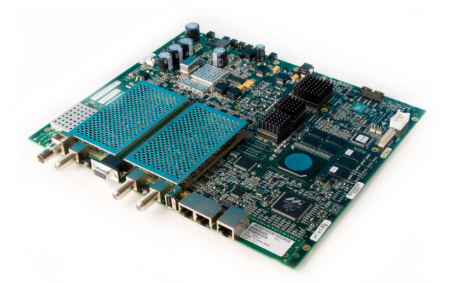
Figure 4 – iConnex e800 Satellite Router Board

Figure 5 below shows the iConnex e850MP Satellite Router Board.