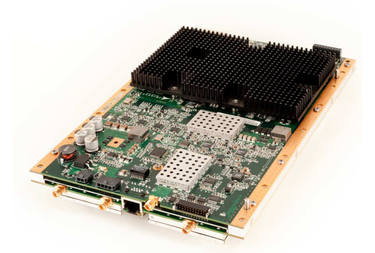
Figure 5 – iConnex e850MP Satellite Router Board

Figure 5 below shows the iConnex e850MP Satellite Router Board.