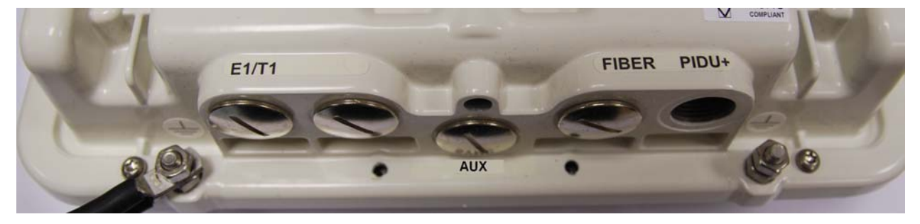
Figure 3: Image showing port identification