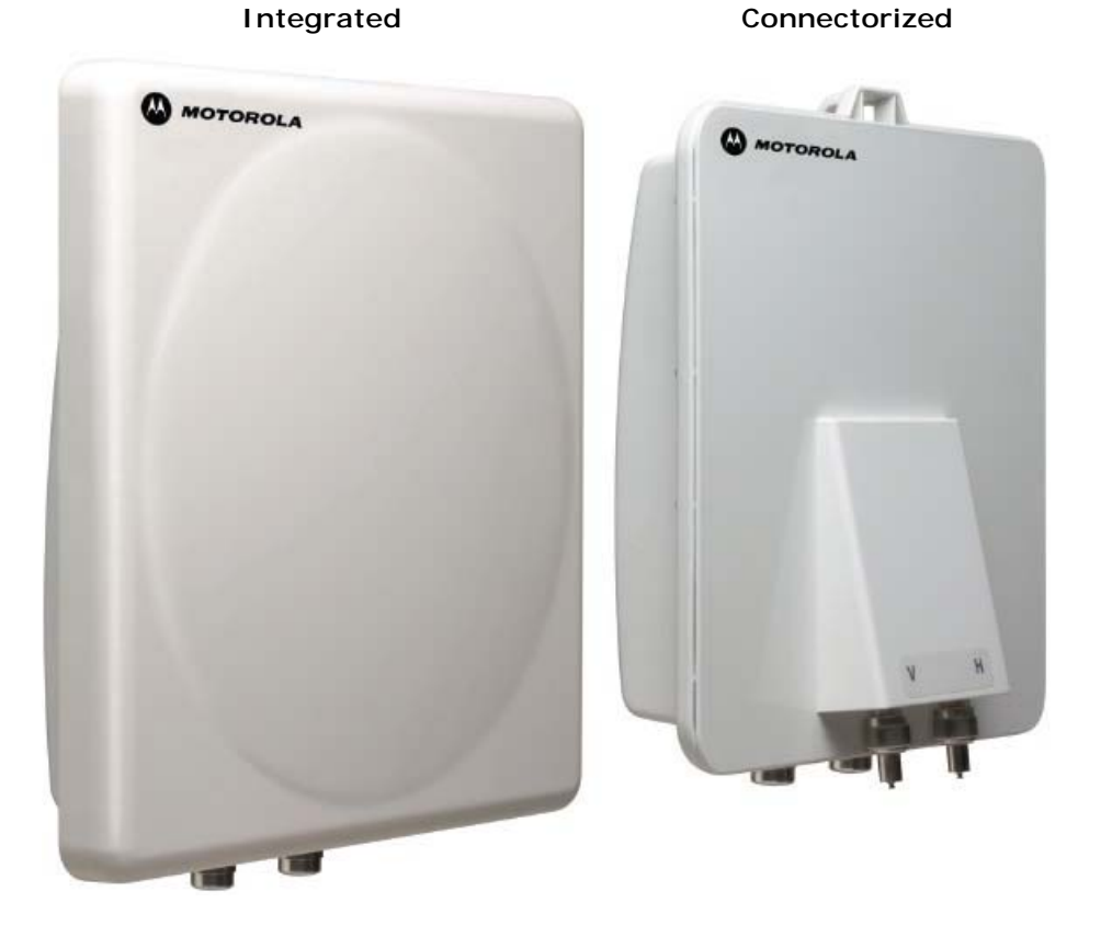
Figure 1: PTP 600 Wireless Units

The primary purpose for this device is to provide data security for Internet Protocol (IP) traffic. The cryptographic boundary of the wireless unit is the unit's external casing. There are two product variants that have a different casing arrangement. Firstly the Integrated wireless units as the name suggests has an integrated RF antenna. The second product variant is named the Connectorized product variant which is identical to the Integrated product except the antenna is replaced by a metal plate with two 'N' type RF connectors. For the purposes of FIPS Validation the integrated antenna is excluded from the cryptographic boundary.