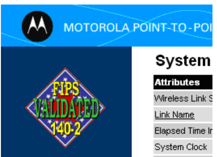
Figure 6: Indication of FIPS 140-2 capability

A user can verify that the wireless unit is capable of operating in FIPS mode by visually inspecting any management webpage and looking for the FIPS logo: