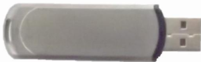
Exhibit 2 – Specification of Cryptographic Boundary