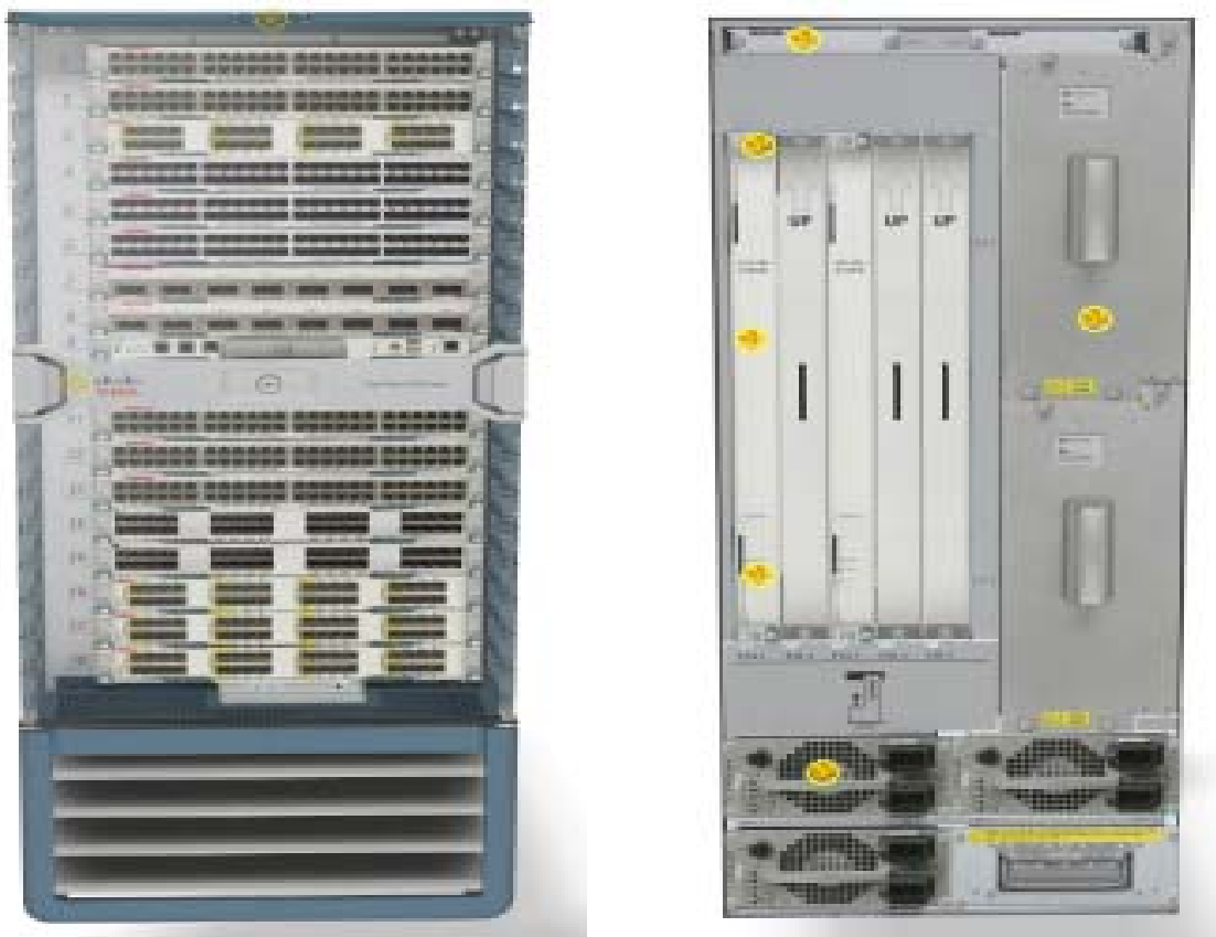
Figure 1 – Front and Back of the Nexus 7000 (18-slot chassis)