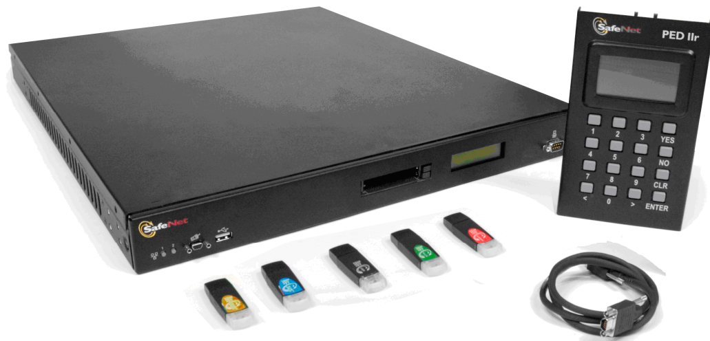
Figure 2-2. Luna SA with PED and iKeys