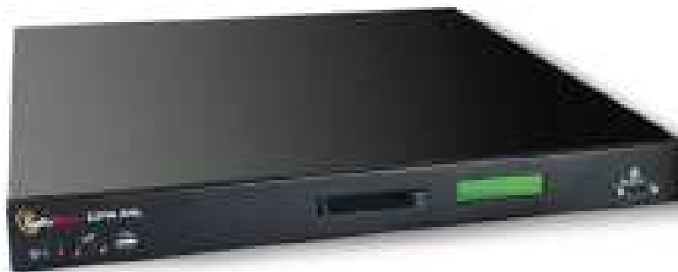
Figure 2-4. Luna XML with Luna PCI Module Installed