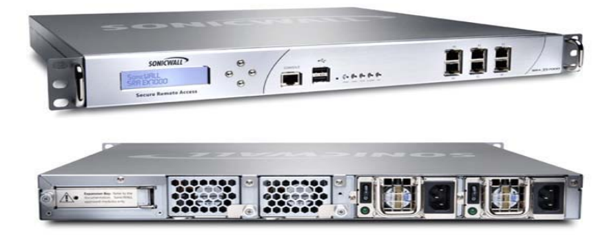
SonicWALL SRA EX7000