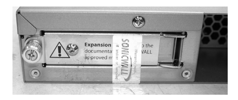
Figure 4: Tamper Seal #3 - Expansion Bay