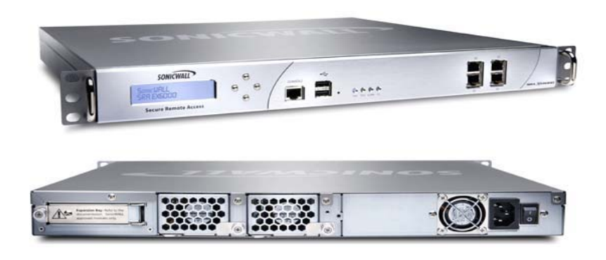
SonicWALL SRA EX6000